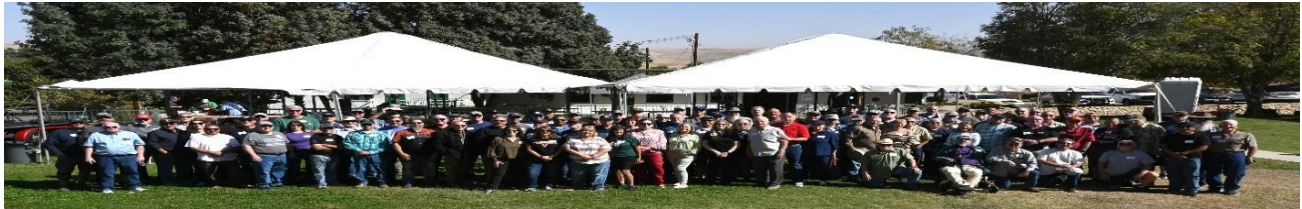
Photo: 2024 Annual Retiree BBQ

Second to Resignations, Retirements accounted for 22% of attrition. Safety personnel have the option to retire once they achieve 10 years of service credit AND are 50 years old, or complete 20 years of service (regardless of their age). Employees hired before 2012 fall under retirement Tier 1, often referred to as the 3% at age 50 plan. We note retirements are trending upward after a decrease 2 years ago, and this will be further discussed in "Retention Efforts."